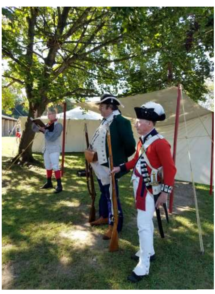
Fort Henry Days